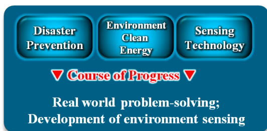
Increasing demand for real-time response to ever-changing environment and needs