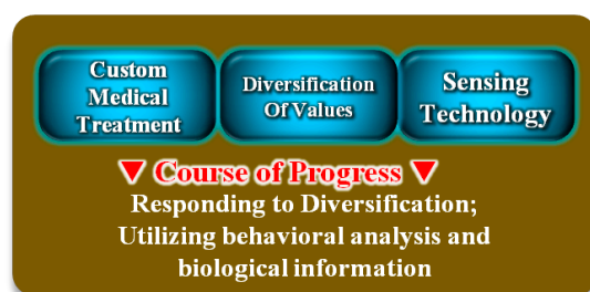
From a mass-oriented society to a society that focuses on individuals