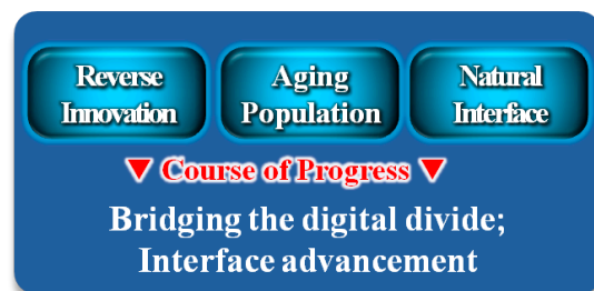
More accessible and user-friendly IT that can be used by anyone