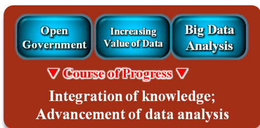
Source of competitiveness shifting towards application of knowledge and information

Real-time response to changes in a variety of fields is made possible by the optimized feedback process through sensing technology and IT capabilities. This trend is expected to help optimize energy use, which is one of the most pressing issues after the Great East Japan Earthquake on March 11, 2011. It is also expected to help respond to unexpected natural disasters and infrastructure crises. In addition to early detection of changes through detailed sensing of environmental conditions and people’s situations steady feedbacks of such changes are returned in real time.