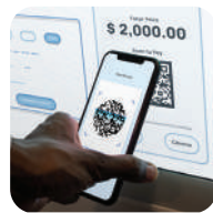
e-Wallet & Mobile Payment